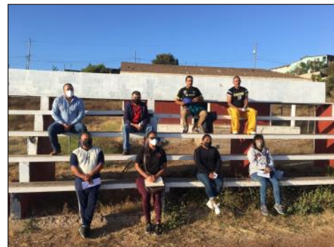
Meeting of our community coaches with a government representative of the City Sports Dept to talk about how to navigate the new guidelines in the future reopening.